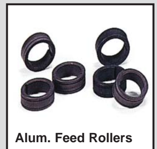
Alum. Feed Rollers